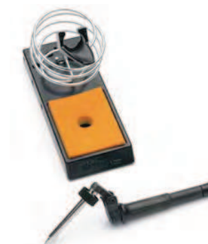
LT Soldering tips: see page 79 / 80